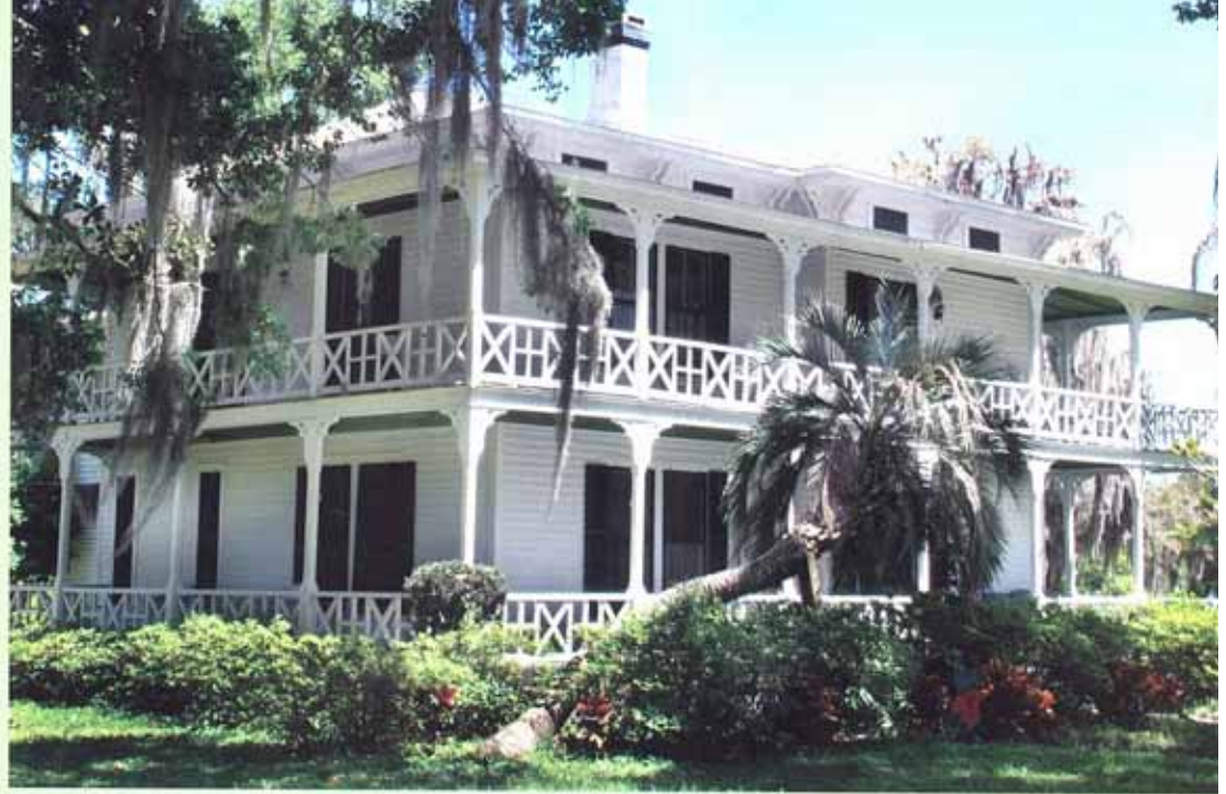
Seelye-Middleton House (c.1885) Palmetto Avenue

know things are looking up when another of those new businesses on Center Avenue is the Stein and Vine . The beer and wine "shoppe" is owned by two sisters and a close friend. They wanted to open such a place for a simple reason, love of wine and people. That's why patrons stopping in for a glass of cabernet feel like they're at Cheers, the bar of