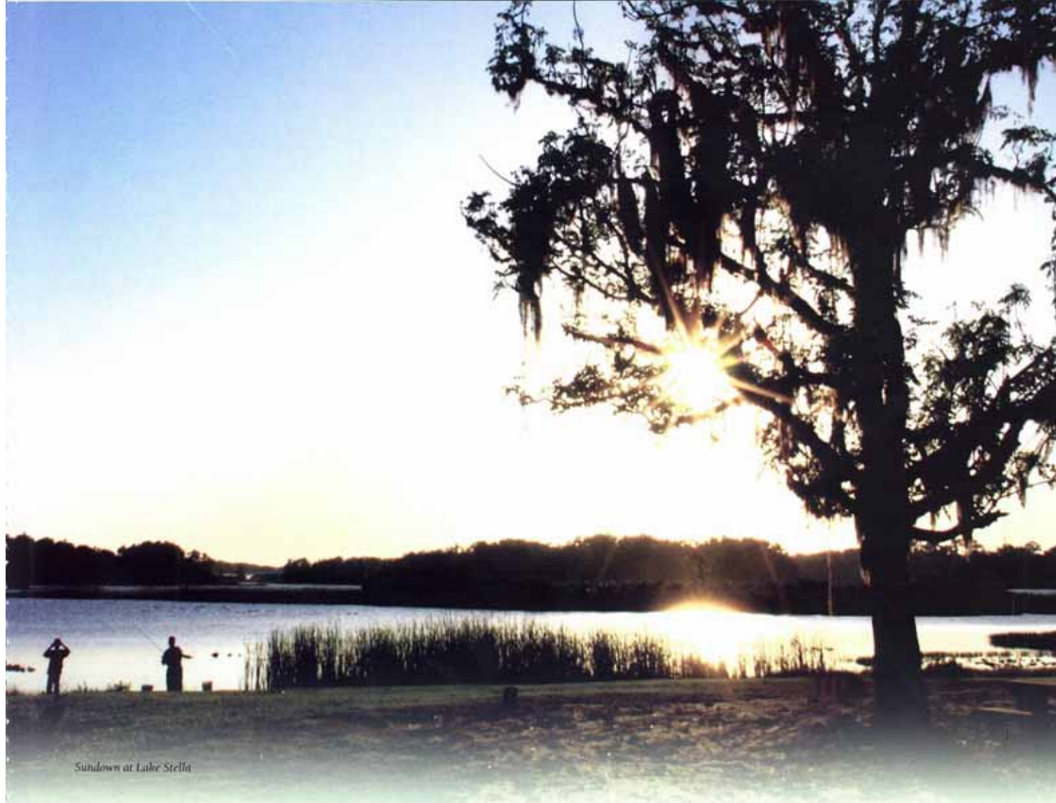
Sundown at Lake Stella