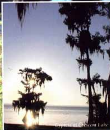
Waterside on Crescent Lake

Clearing the land for the project should begin this summer.