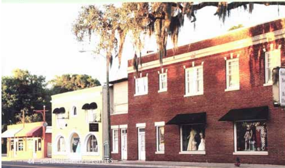
Shops on Summit Street