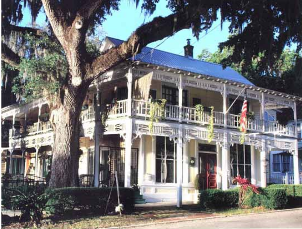
Sprague House Bed and Breakfast

other city officials are convinced it will have a positive effect.